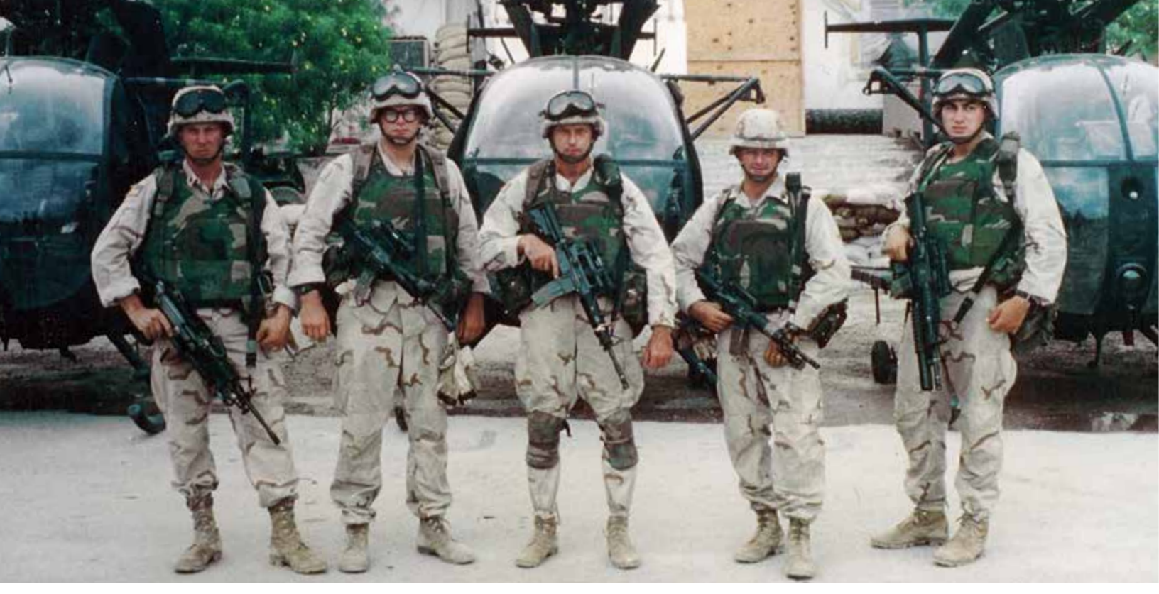
U.S. Army Rangers put their new Ranger Body Armor (RBA) to the test during the Battle of Mogadishu in October 1993.