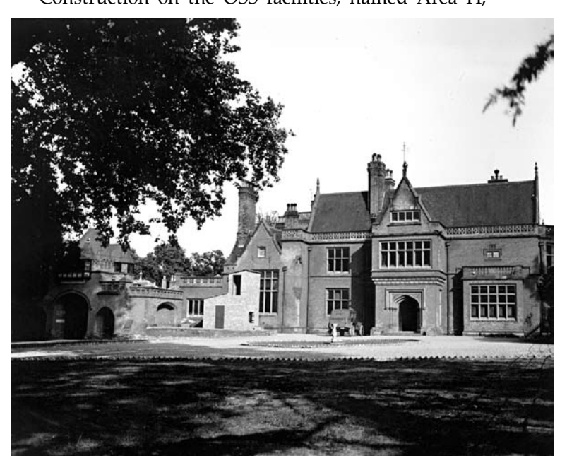
Holmewood House, Holme, UK, served as the officer's quarters and planning facility for Area H.

Construction on the OSS facilities, named Area H,