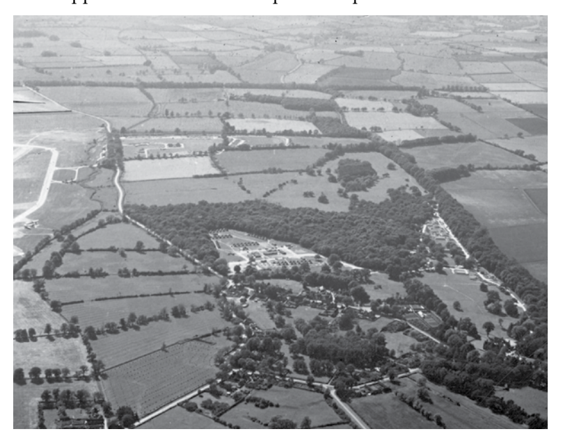
Area H at Holmewood, UK, as seen from the air.