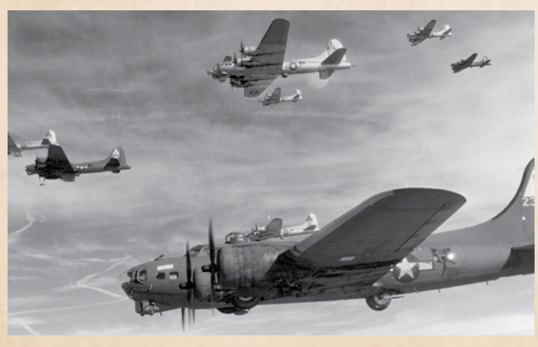
B-17s of the USAAF 8th Air Force over England in 1944.