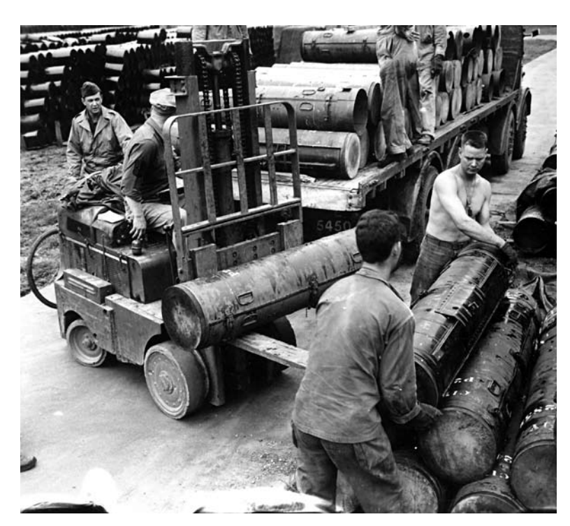
Packed containers are loaded for shipment to a local airfield. Sergeant James Gearing, on the bicycle behind the forklift, is supervising.

learning curve for the Carpetbaggers. Only twenty-eight of seventy-six operational sorties were successful.<sup>29</sup> "Success" was defined as containers dropped and the plane returned. The crew never knew if they dropped supplies to a German-controlled group, or if the supplies were undamaged. By March, the ratio had improved with forty-four of seventy-two sorties successful. During the first three months of 1944, 6 agents, 799 containers, and 265 packages—with more than a million rounds of small arm ammunition—were dropped, with a loss of three aircraft.<sup>30</sup> In July 1944, the Carpetbaggers were assigned the mission of bringing personnel back from occupied Europe. A few C-47s were attached to the Carpetbaggers,