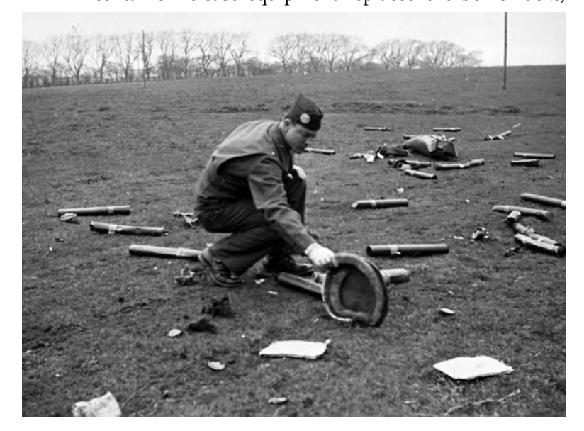
According to the original caption written on the back of this photo, not one of the Bazooka rounds exploded during this free-drop test.

Carpetbagger or RAF crews supervised the loading and dropping of supplies, as well as any agents being infiltrated into the occupied territories. The Carpetbaggers used specially modified B-24 Liberators. These planes had radar, flash suppressors mounted on their machineguns in the top and rear turrets, static-line cables, British container release equipment replaced the bomb racks,