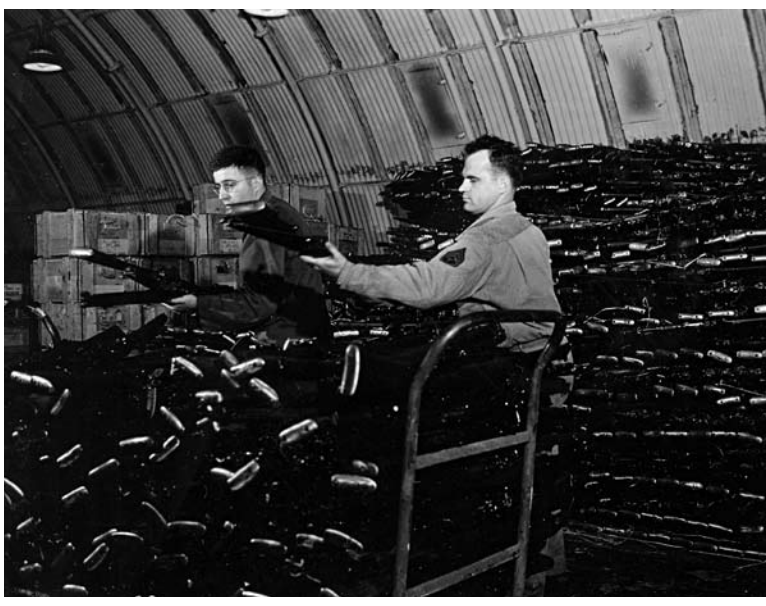
Stacks of British Enfield rifles await packing into containers.