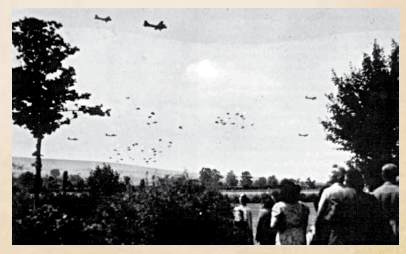
French civilians observe USAAF B-17s dropping supplies on 14 July 1944 (Bastille Day) during Operation CADILLAC.