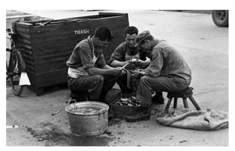
... or on KP!

The OSS logistics effort at Area H was an unqualified success. During 1944, Area H packed 50,162 containers