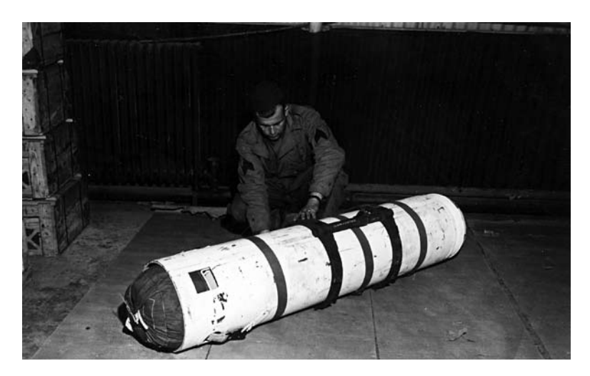
White canisters were used for air-drop operations in Scandinavia.

for air delivery by the RAF and the USAAF.<sup>37</sup> In the first nine-months of 1944, this included more than 75,000 small arms and 35,000 grenades. Area H provided 96 tons of supplies to Belgium, 9 to Denmark, 3,055 to France, 119 to Poland, and 56 to Norway.<sup>38</sup> Operations in 1945 in Denmark and Norway raised the total tonnage supplied. Supplying the resistance forces, as well as the SOE and OSS teams in occupied Europe, did not come without cost. Twenty-one Carpetbagger aircraft and most of their crews were lost in action.