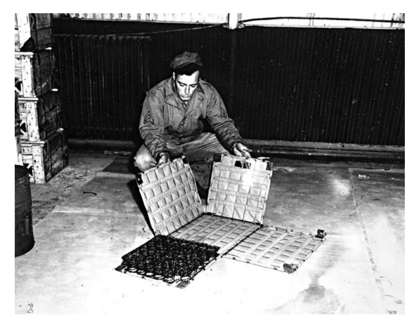
This spring "mattress" acted as a shock absorber for nonstandard packages.

could withstand the opening shock of the parachute as well as the landing. These were referred to simply as "packages."