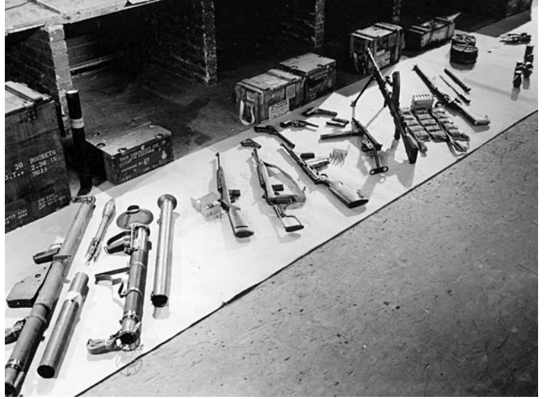
A selection of arms that were dropped into German-occupied Europe. From left to right: bazooka (assembled and disassembled), M-1 carbine, M-1 carbine with folding stock, a United Defense model 42 submachinegun, a British Sten submachinegun, a British Bren light machinegun, and a British Enfield rifle.

The Carpetbaggers pioneered low-level night flying in the USAAF. All missions were conducted only during the full moon period, when the extra light could assist the pilot's vision. European based–USAAF bombing squadrons clung to the doctrine of daylight "precision" bombing. The Carpetbaggers stayed below 2,000 feet to avoid German radar and anti-aircraft defenses as well as to make more precise airdrops. The Carpetbagger plane communicated with the ground contacts using a device called an "S" phone, a shortrange ground-to-air radio, which allowed greater accuracy in drops. If the reception committee did not have an "S" phone, they communicated using flashlights or