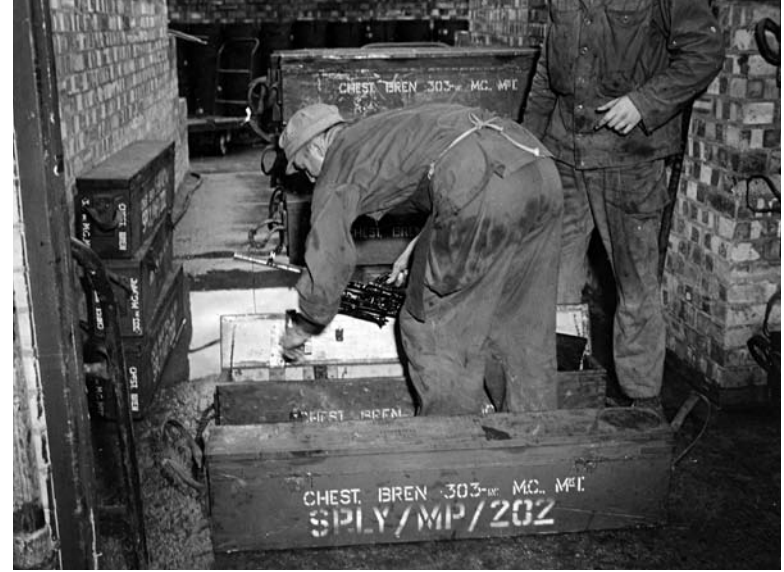
British Bren light machineguns are unpacked from their transit cases prior to being packed into drop canisters.

Often, drops to multiple groups required similar items. This led to the development of a series of standard loads. It also provided a more accurate estimate of the total weight of a load going into a drop aircraft. For instance, one of the standard loads for an "H" container was 5 Sten guns with 15 magazines, 1500 rounds of 9mm ammunition, 5 pistols with 250 rounds of ammunition, 52 grenades, and 18 pounds of explosives. The weight of this container was 281 pounds. The contents of each container were distributed and packed into each cell to bal-