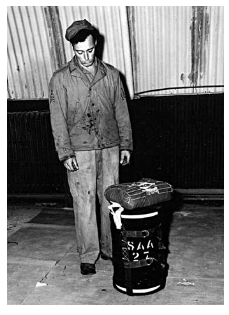
A completed "package" is ready for dropping.

recalled that his containers appeared "to have been packed especially for us and contained those items requested, to additionally include any APO mail from home . . that mail was heavily censored at Algiers HQs with some of it looking like paper off the player piano roll—what with the excision of names of persons and places. The mail also included goodies from home such as Mom's favorite cookies, salami, etc. . . I recall one container had a