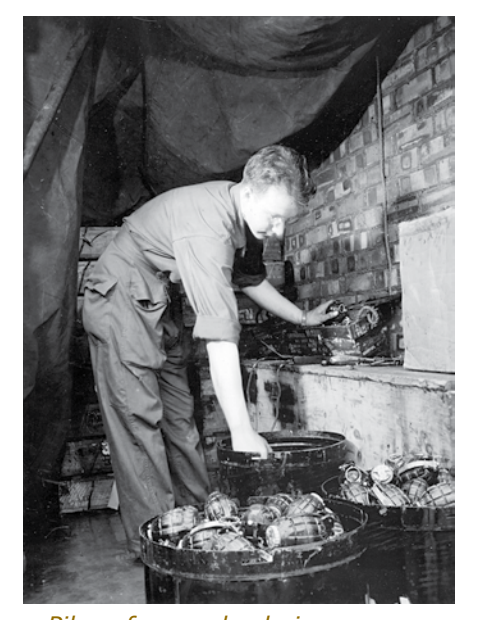
Piles of grenades being packed.

was started in January 1944 and completed two months later. Area H became the largest SO supply facility in the European Theater.15 By then, Area H could accommodate 18 officers and 326 enlisted men.<sup>16</sup> Although electricity and water came from offsite, heating came from a newly constructed power house. Sheet metal buildings housed the dispensary, administrative and maintenance sections, as well as the motor pool.