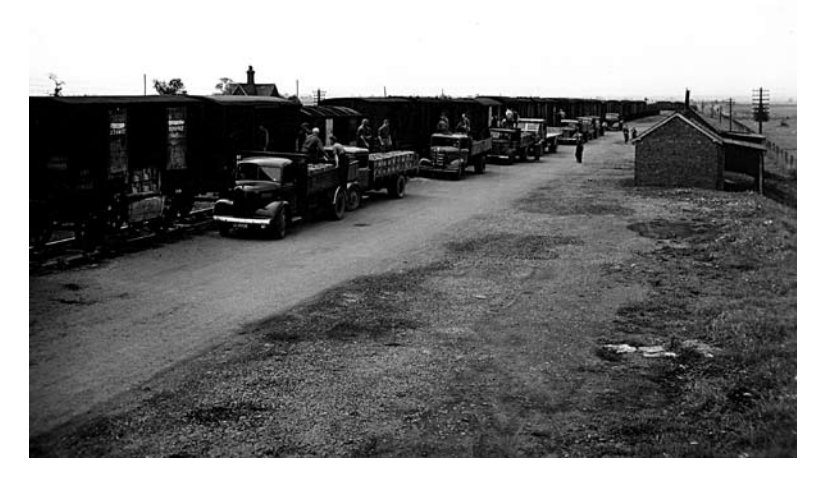
Personnel at Area H unload supplies from the local rail station. These supplies would then be packed and dropped into occupied Europe.

and through September 1944, carried seventy-six agents into occupied Europe, and exfiltrated 213.<sup>31</sup>