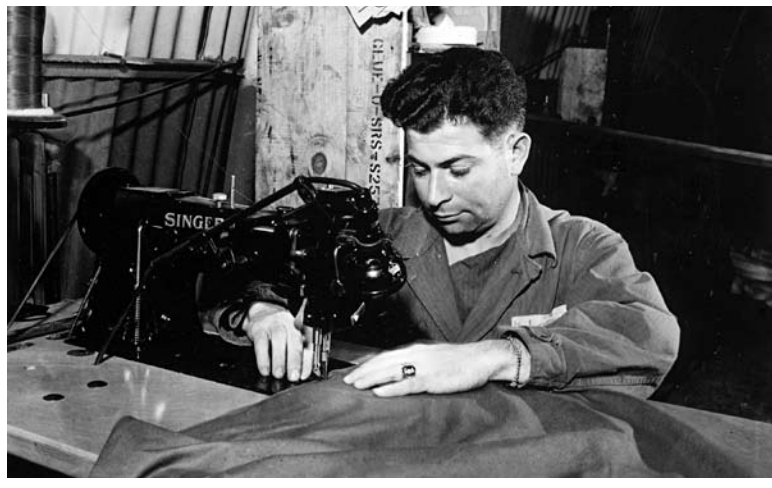
The riggers at Area H could be called upon to repair parachutes, make harnesses, or to construct diplomatic mailbags that were used to smuggle supplies to neutral Sweden for the Norwegian government in exile.

Bomb Group dropped 551 agents and 4,511 tons of supplies, at the loss of 223 aircrew. By then, the scope of their operations included France, Belgium, the Netherlands, Germany, Italy, Poland, and Norway.<sup>34</sup>