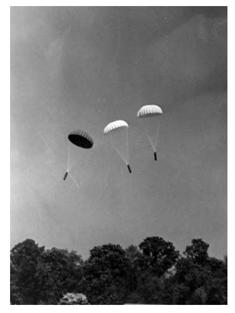
A test drop at Area H.

ance the load and improve the chances of an easy landing.<sup>22</sup> The same was true for a "C" container. In one standard load, a "C" could hold two British Bren light machineguns complete with 16 magazines and 2000 rounds of .303 ammunition, weighing 303 pounds.23 To verify their packing techniques, the personnel at Area H conducted drop tests-including drops of items—to see if their containers, packages, or even bazooka rounds, survived intact.