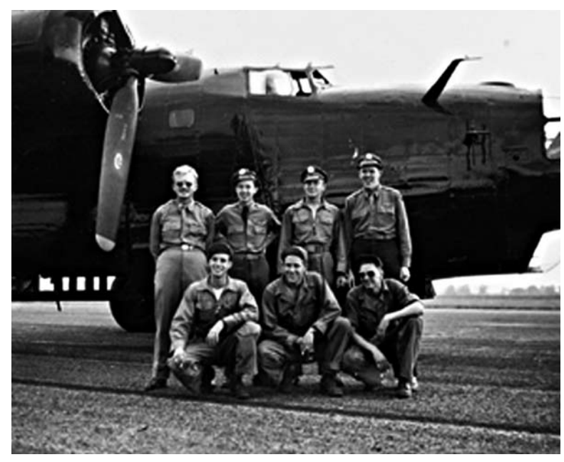
A Carpetbagger crew outside their B-24 Liberator that has been modified for night dropping operations. Notice the lack of a front turret, which was removed on Carpetbagger B-24s, and that the aircraft is painted all black.

USAAF began dropping supplies into occupied Europe in January 1944. These initial drops started an ever-increasing demand on Area H.<sup>28</sup> Operations conducted in January and February 1944 presented a steep