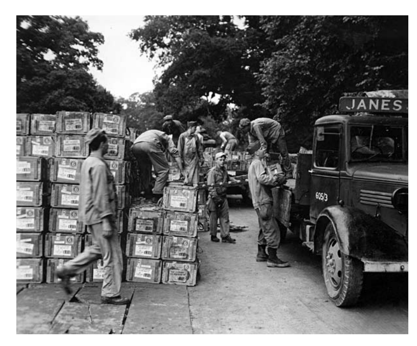
Unpacking ammunition at Area H. Notice the business sign still on the requisitioned civilian truck.