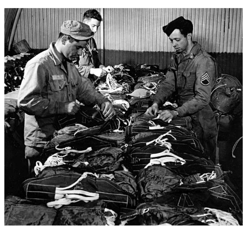
Riggers are stowing the static lines on parachutes that will be attached to canister containers.