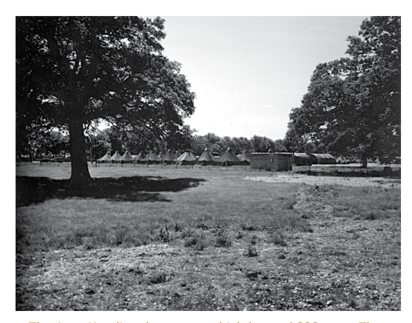
The Area H enlisted quarters which housed 323 men. The tents were erected over concrete slabs.

Isolated buildings for ammunition and explosives, such as incendiary devices, were erected away from the main camp. That area had four Nissen huts and five brick buildings. Each was revetted with brick walls to contain accidental explosions.<sup>17</sup> Another Nissen and four Romney huts housed the packing operations.<sup>18</sup> A new brick storage shed served to protect the packed containers. Area H could store 500 tons of material. The SOE base at St. Neots could handle an additional 300 tons. Security for Area H was heavy. High woven-wire fences topped